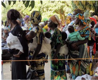
Mothers and their children wait in line at a food distribution site.

This year's Christmas offering goes to the Nigeria Crisis Fund for the Church of the Brethren in Nigeria. Your gift to this fund will help provide temporary shelter, emergency food, household supplies, clean water and sanitation as well as trauma healing programs to Nigerians made homeless and suffering by the Boko Haram.