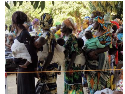
Mothers and their children wait in line at a food distribution site.

This year's Christmas offering goes to the Nigeria Crisis Fund for the Church of the Brethren in Nigeria. Your gift to this fund will help provide temporary shelter, emergency food, household supplies, clean water and sanitation as well as trauma healing programs to Nigerians made homeless and suffering by the attacks of the Boko Haram.