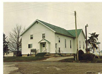
PLEASANT CHAPEL CHURCH ASHLEY, INDIANA 1984