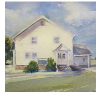
PLEASANT CHAPEL CHURCH ASHLEY, INDIANA 1984

Worship service at 9:15 Sunday school at 10:30