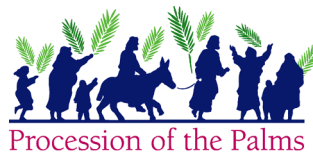
Procession of the Palms